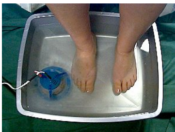
(Click the photo)