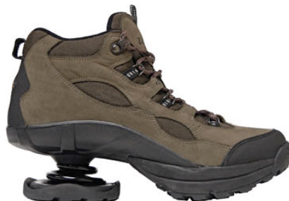
New Brown Desert Hiker